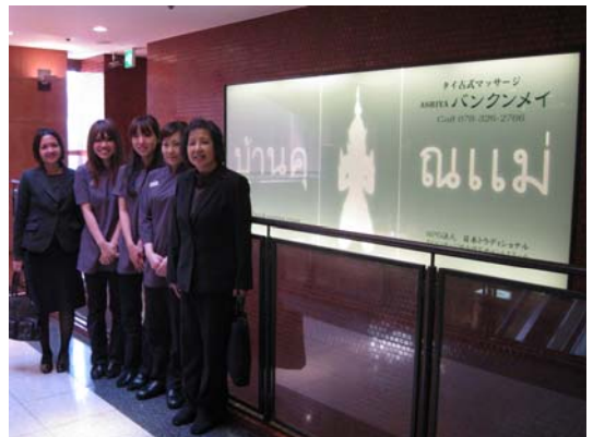
■ TTC with the therapists of Bankunmei,Sannomiya