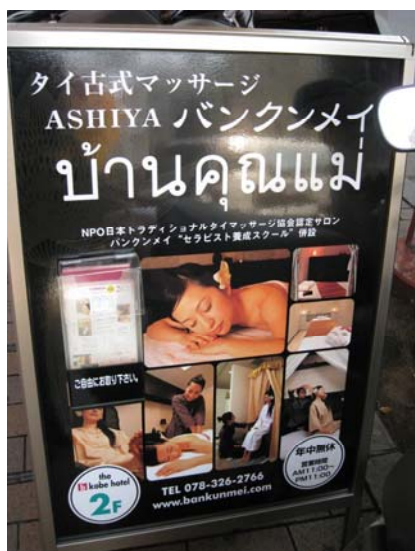
■ Signboard on the road