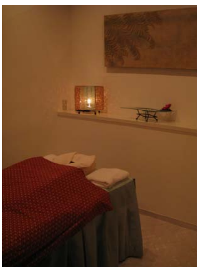
■ Thai Aroma Oil Massage Room